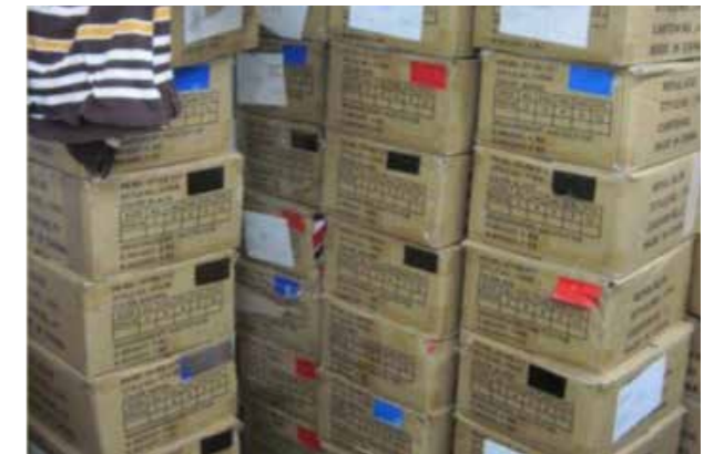
New-York- 2013- Seizure of a hundred of pants of different brands

This traffic is now clearly part of these highly lucrative, low-risk sectors, which drain an entire parallel economy where many extremist groups thrive. From the manufacture to the distribution, all the chain is controlled and it becomes difficult to refrain the counterfeit expansion in a world where it is dealt as a minor offence, where as its consequences are majors today.