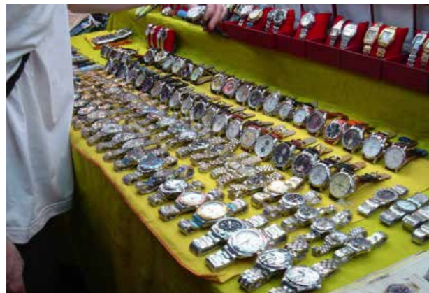
Counterfeit Market in Thailand, See: http://forum.horlogerie-suisse.com/viewtopic.php?t=3050

The counterfeiter therefore aims to create confusion between the original product and the counterfeit product, in order to benefit from another's reputation or the result of investments made by the true holder of an intellectual property right. From a legal viewpoint, digital piracy (music, film, software, book, graphic) is therefore a form of counterfeiting, as is the production of fake brand items.