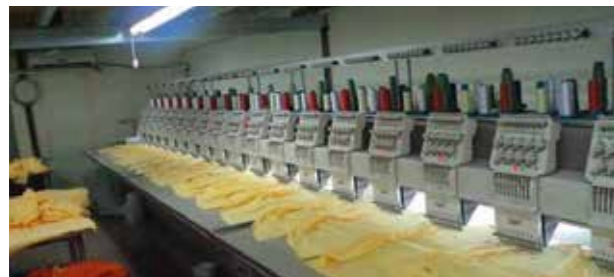
Counterfeit production facilities in Ho Chi Minh (Vietnam)