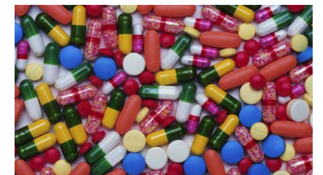
Study on counterfeiting of medicines, see http://tpe-medicaments.e-monsite.com/

According to the United Nations Commission on Crime Prevention and Criminal Justice recalled that counterfeiting is now the second largest source of criminal incomes worldwide 15 .