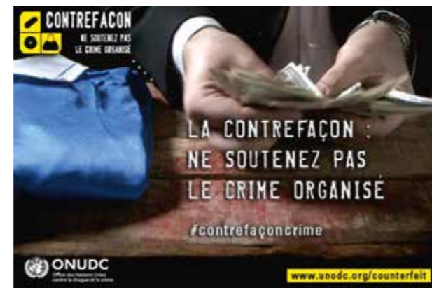
Campaign UNODC, "Counterfeit: don't buy into organized crime". See: http://www.unodc.org/counterfeit/fr/index.html