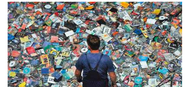
The piracy of DVD finances terrorism. Le Temps. See http://letemps.ch/Page/Uuid/d74e1a92-1ca4-11de-ad82-

Researchers of the RAND Corporation 24 also highlighted the links between piracy and terrorism. In their opinion, terrorist groups have hence decided to diversify their funding sources and adopt methods of organised crime by choosing film piracy.